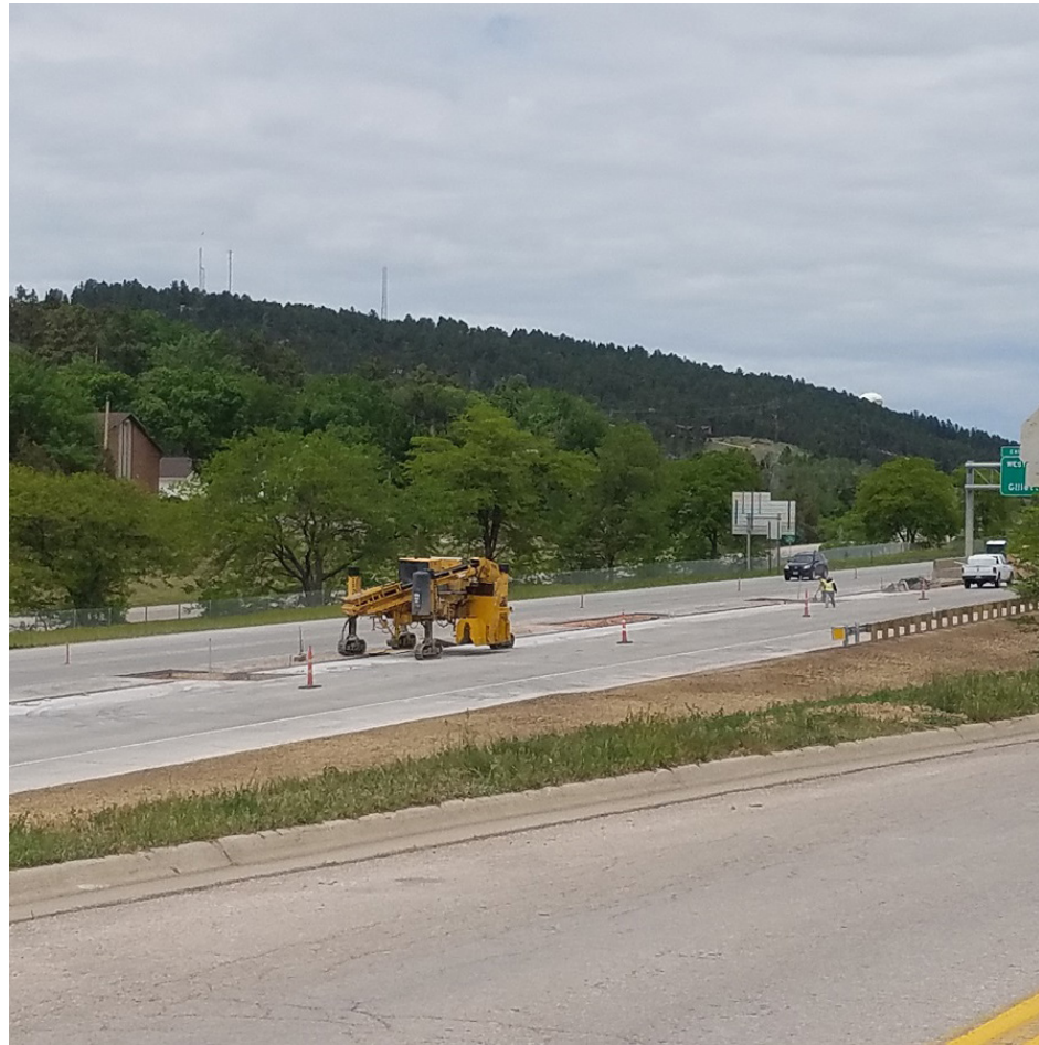
I-190 traffic has been moved to the two outside lanes, while median work is completed. Light poles will be installed and concrete median barrier installed to divide southbound and northbound traffic.

The I-190/North Street interchange is scheduled to open at the end of the month.