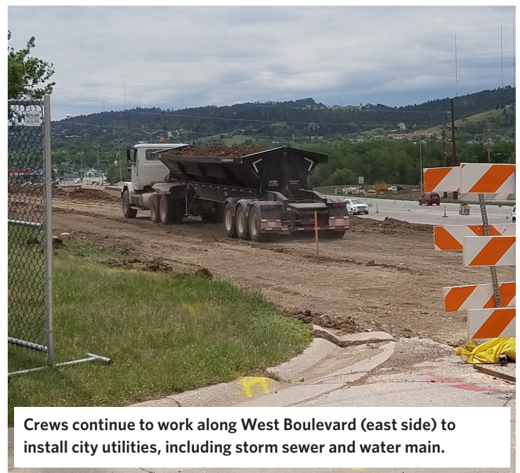
Crews continue to work along West Boulevard (east side) to install city utilities, including storm sewer and water main.

Detour routes available at: www.sdi190interchange.com