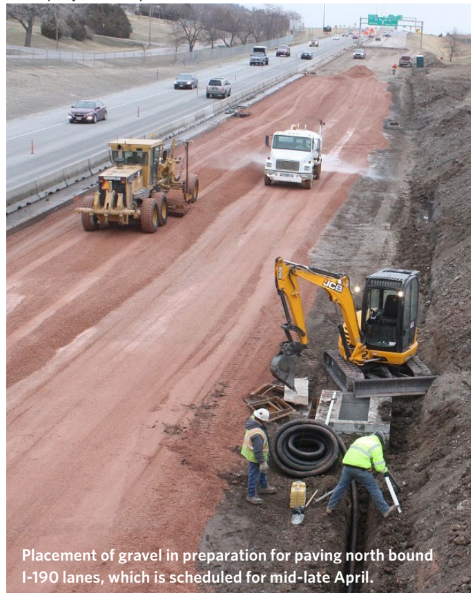
Placement of gravel in preparation for paving north bound I-190 lanes, which is scheduled for mid-late April.

Detour routes available at: www.sdi190interchange.com