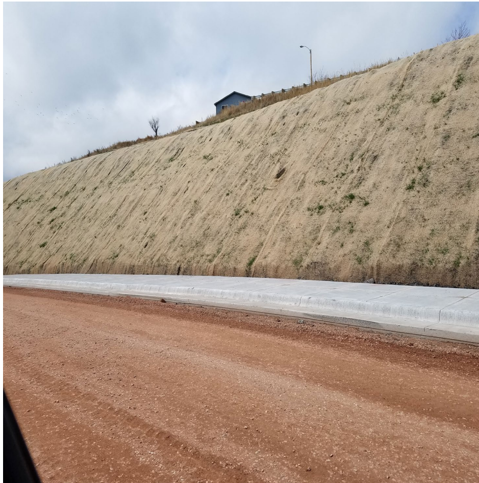
Sidewalks and curb and gutter have been installed along the newly-named Nickel Street (formerly West Boulevard-west).

Curb and gutter and surfacing will start to be placed on North Street.