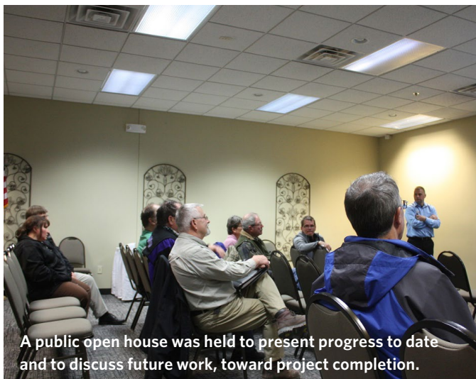
A public open house was held to present progress to date and to discuss future work, toward project completion.