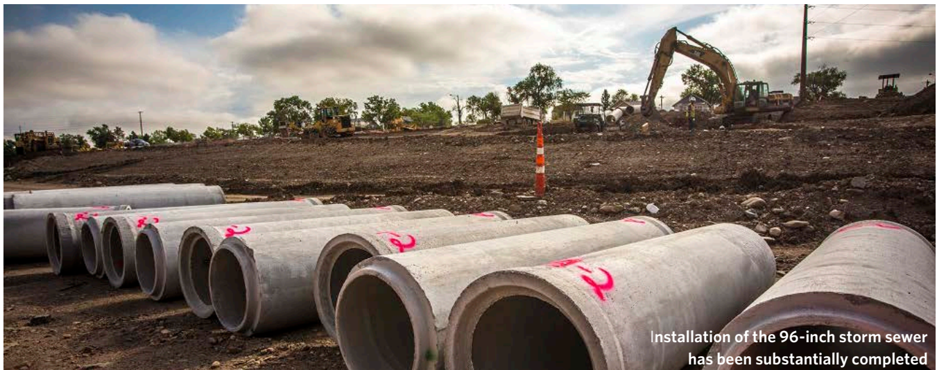
Installation of the 96-inch storm sewer has been substantially completed

Detour routes available at: www.sdi190interchange.com