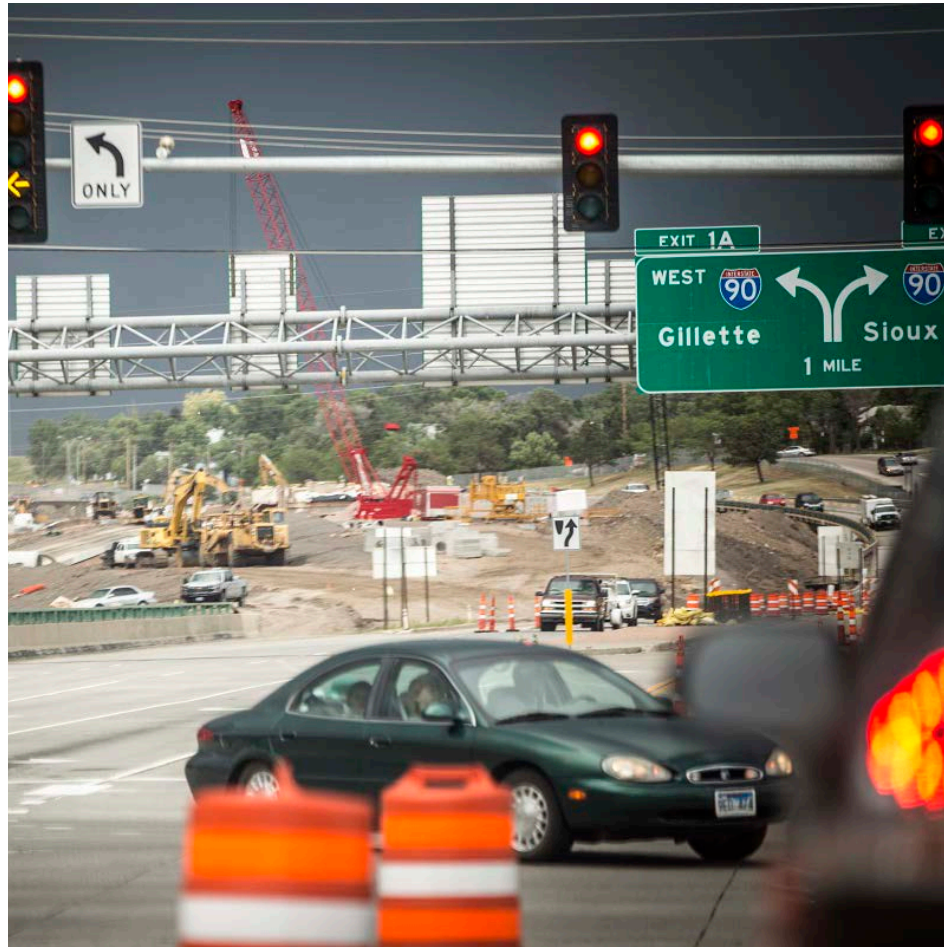
Work continues on the new bridge, while two way traffic is routed in the northbound lanes. Two way traffic is expected to shift to the newly constructed southbound lanes in October when the project enters Phase 3.

Phase 3 of the project will be implemented. Two-way traffic will be switched from the northbound lanes to the southbound lanes so that demolition of the existing northbound lanes and old bridge can start.