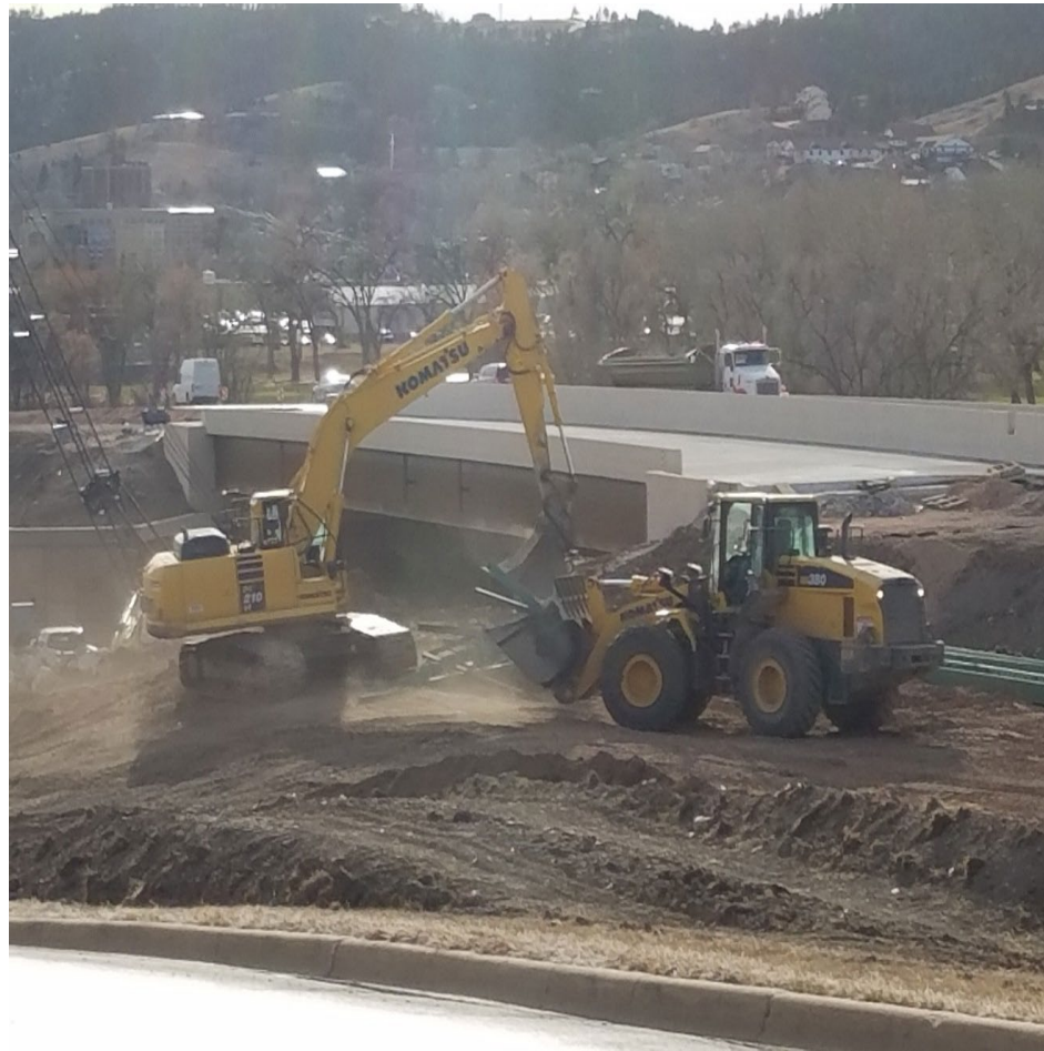
The old bridge has been dismantled for salvage. Heavy equipment completes clean up tasks in this area.

The final public meeting to discuss project activities to date, upcoming work, and anticipated project completion schedule will be held. The date of the meeting will be published in advance.