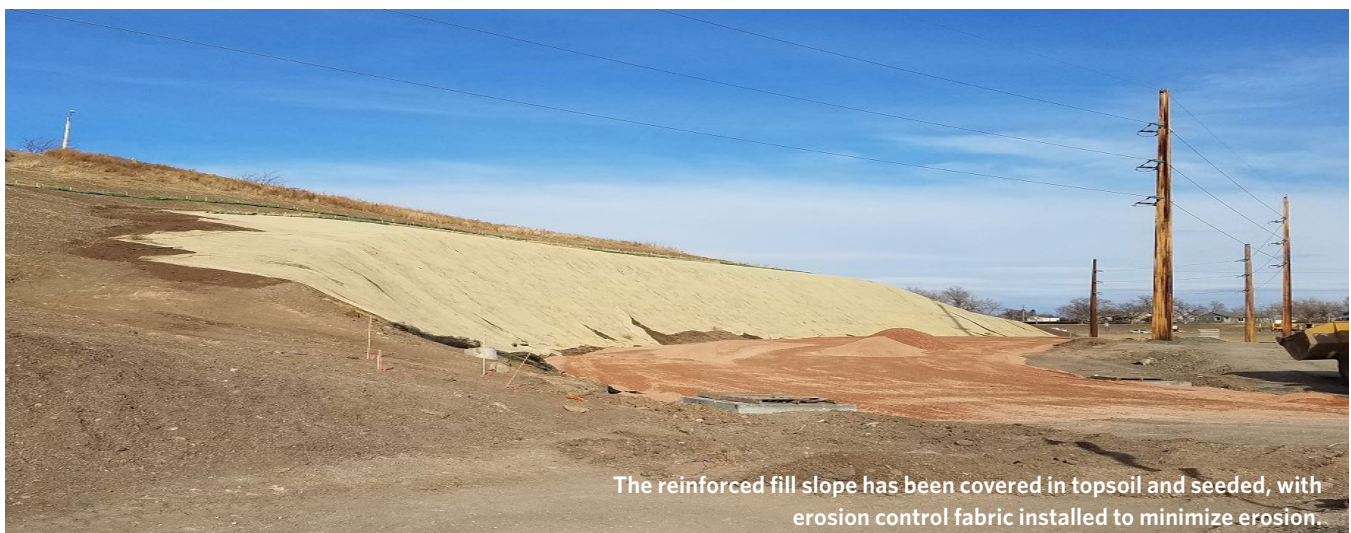
The reinforced fill slope has been covered in topsoil and seeded, with erosion control fabric installed to minimize erosion.

Detour routes available at: www.sdi190interchange.com