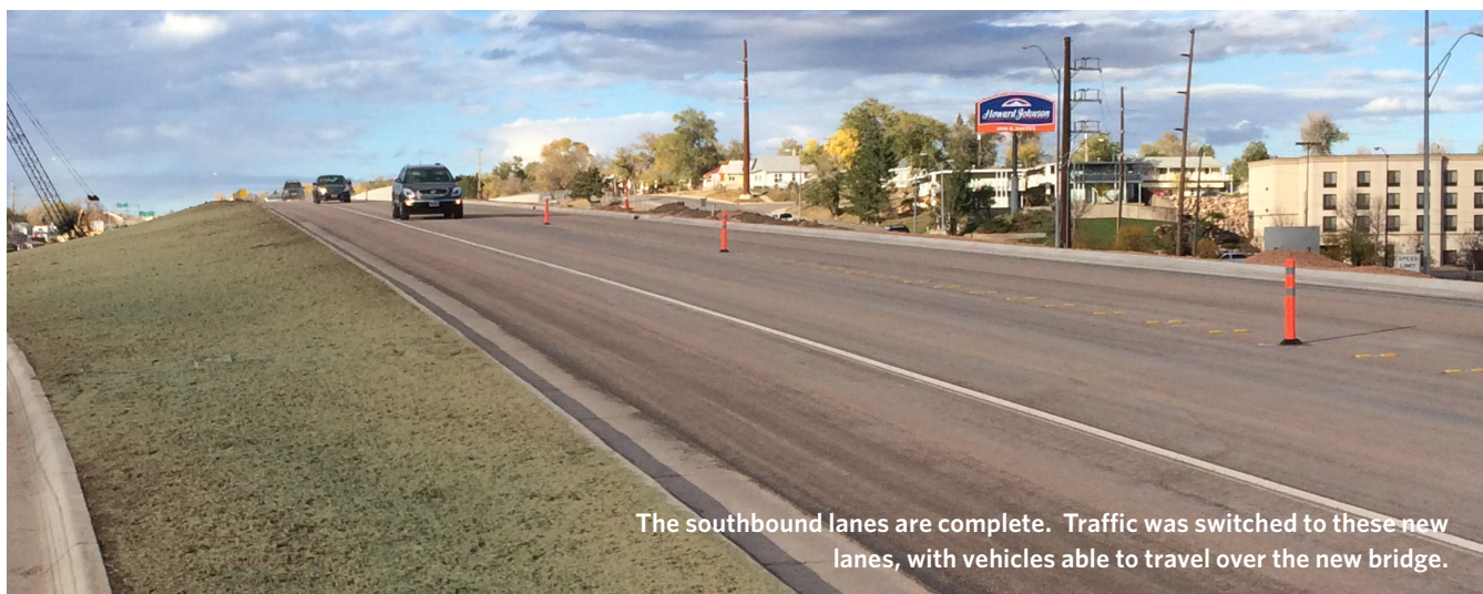
The southbound lanes are complete. Traffic was switched to these new lanes, with vehicles able to travel over the new bridge.

Detour routes available at: www.sdi190interchange.com