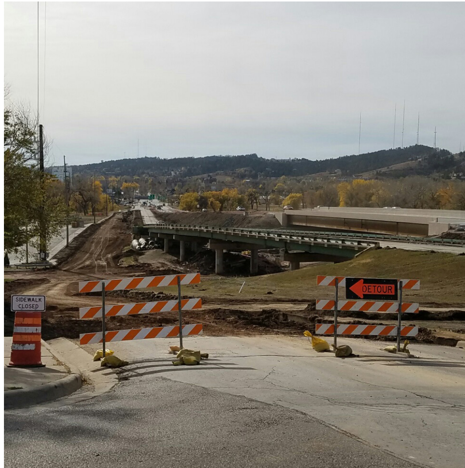
The northbound I-190 off ramp was closed, and demolition of the northbound lanes started. The old bridge is expected to be demolished starting in November.

Work on the storm sewer and grading in the northbound lanes as weather allows.