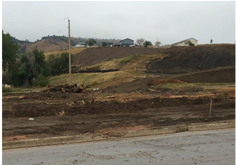
Soil was removed and relocated to on-site stockpiles for use later in the project.

To prepare for bridge construction, the contractor plans to install the traffic crossovers on I-190 this fall. The inside lanes for both northbound and southbound traffic will be temporarily closed while the new crossovers are constructed. This work should be completed in two weeks once it begins. The crossovers will be blocked off for the winter and then utilized in the spring when traffic is shifted to two-way traffic in the southbound lanes.