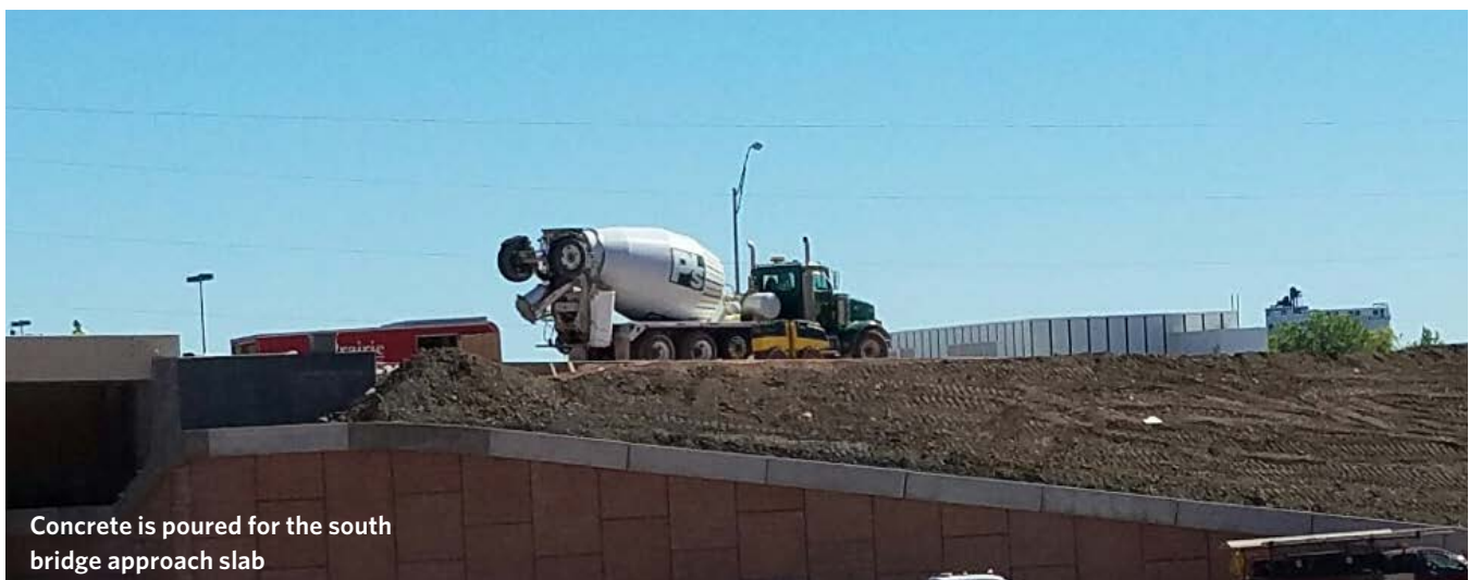
Concrete is poured for the south bridge approach slab

Detour routes available at: www.sdi190interchange.com