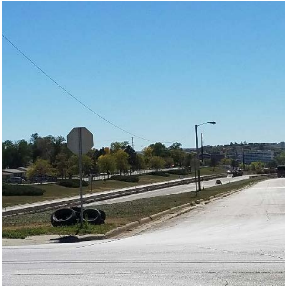
The southbound lanes are substantially complete, with seeding and erosion control advancing. Guard rail will be installed over the next two weeks in preparation for switching two way traffic to the newly completed lanes.

Demolition of the northbound lanes, including the old bridge will commence. Utility work in the Silver Street intersection will continue as weather allows.