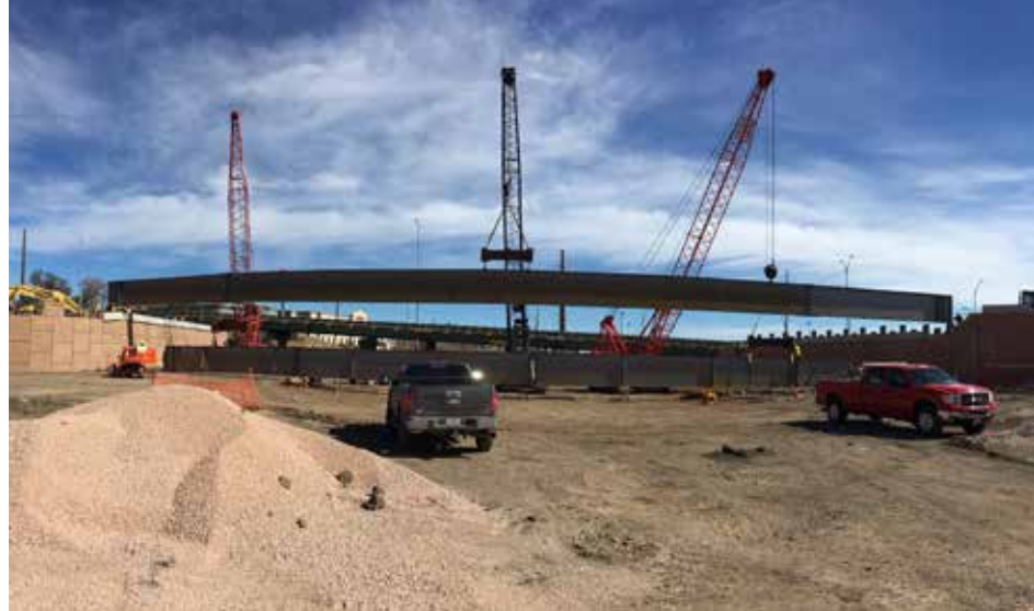
Steel bridge girders have started to be delivered, bolted together and set into place on the bridge pilings. A total of 12 girders will be installed and concrete bridge deck placement will begin following girder installation.

Storm sewer installation will continue and is expected to be completed by the end of the month for Phase II. Subgrade of the south bound lanes and ramps will be graded and prepared for surfacing. Concrete paving of the south bound lanes will be initiated. Electrical conduit for the street lighting will be installed.