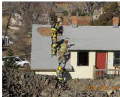
The Rapid City Fire Department used the soon to be demolished house on Philadelphia Street for valuable, hands-on training.